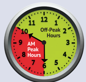
6am - 10am Weekdays