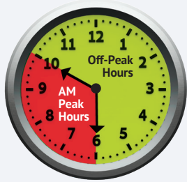
6-10 AM Weekdays

Winter Peak Hours (November - March) for PWC Electric Customers