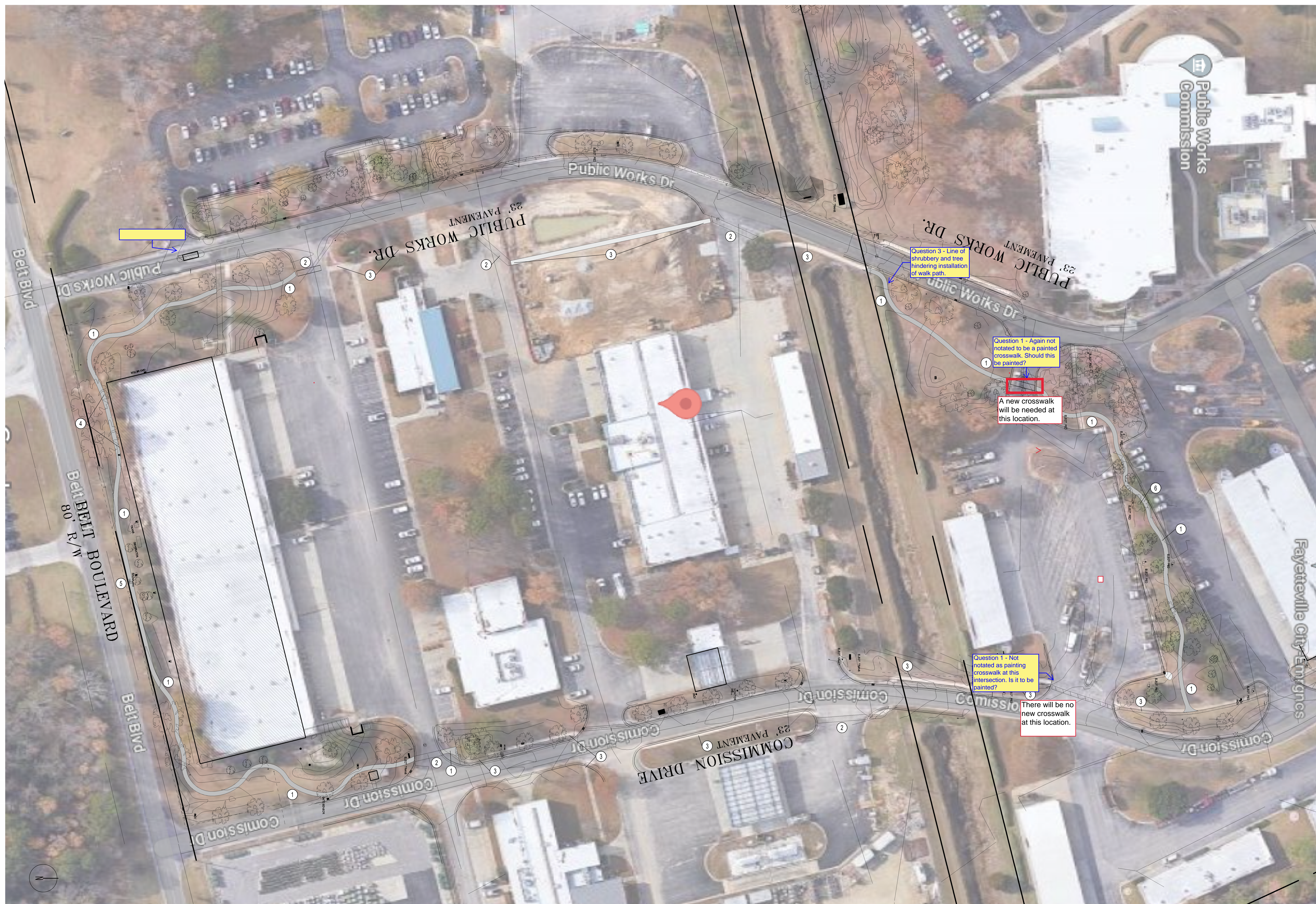
1 SITE PLAN - WALKING TRAIL CE1.2 1" = 50'-0"